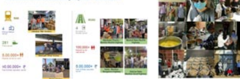
Food distribution for travelling migrants – Rail & Road

Moreover, grocery kits were distributed including essential items such as rice, flour, sugar, masks, sanitisers, sanitary napkins, etc.